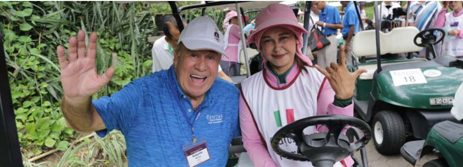
22 Centara World Masters Golf Championship June 2023

Note: Australian/NZ participants are not required to provide any additional information as the tournament committee will access your handicap information from the Golf Link and Golf Co Nz website.