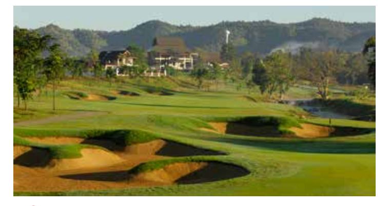
#6 Best of Chiang Mai Golf

Prize includes 3 rounds of golf, 4 nights Deluxe Hotel and all airport & golf transfers for 2 persons.