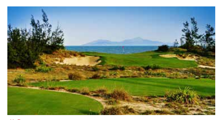
#3 Best of Danang Golf

Prize includes 3 rounds of golf, 4 nights Deluxe Hotel and all airport & golf transfers for 2 persons.