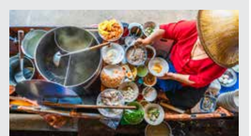
Floating Market Tour (6 hrs)

Comfortable attire and walking shoes recommended