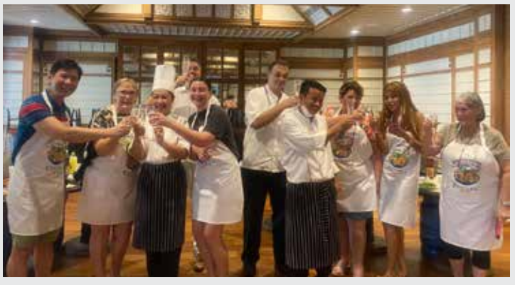
Thai Cooking Class (3 hrs)

Monday or Tuesday Meet at Centara Railway Restaurant: 11:00am