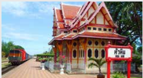
Hua Hin Historical Tour (6 hrs)

Comfortable attire and walking shoes recommended