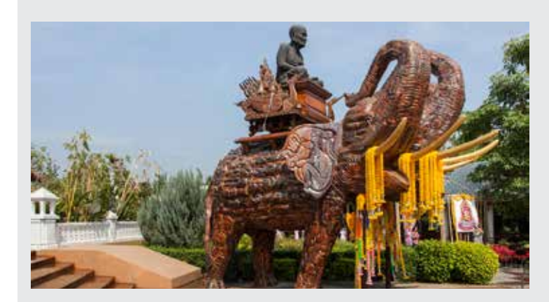
Wat Huay Mongkol & Monsoon Winery Tour (4 hrs) Monday or Tuesday Meet at Centara Lobby: 9:30am

The Wat Huay Mongkol temple is renowned for its colossal statue of the revered monk Luang Phor Thuad. People from across Thailand visit to pay homage and seek blessings for various desires like luck, health, fortune, and happiness. Thailand, traditionally not known for wine production, now boasts several vineyards. Monsoon Vineyards invites you to explore their vineyard, learn about winemaking, sample their wines, and enjoy a tour of the area. Lunch included.