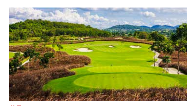
#5 Best of Pattaya Golf

Prize includes 3 rounds of golf, 4 nights Deluxe Hotel and all airport & golf transfers for 2 persons.