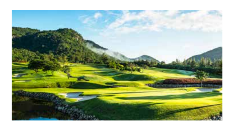
#1 One entry to the 2025 Centara World Masters Golf Championship

Prize includes tournament entry package, 6 nights at the 5 star Centara Grand Beach Resort, daily golf transfers and return airfares.