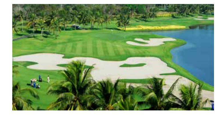
#4 Best of Bangkok Golf

Prize includes 3 rounds of golf, 4 nights Deluxe Hotel and all airport & golf transfers for 2 persons.